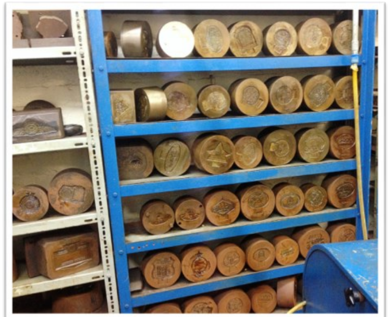
Aha! These looked familiar....behold the Morgan club badge "dies."