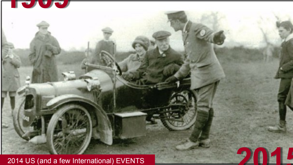
2014 US (and a few International) EVENTS