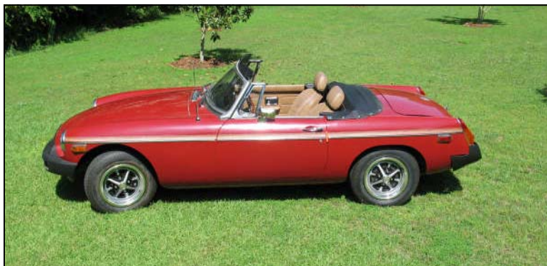
For Sale: 1980 MGB