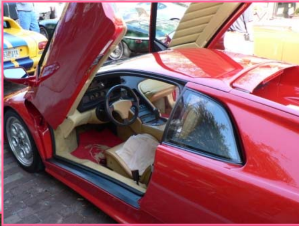
the red cars . . .