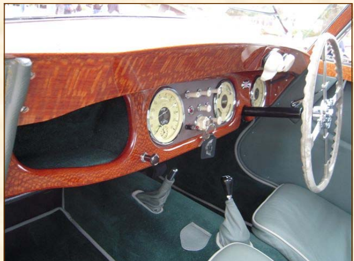
This car was on the field in the 2009 Pebble Beach Concours and was Awarded a 3rd Place. Superb !!