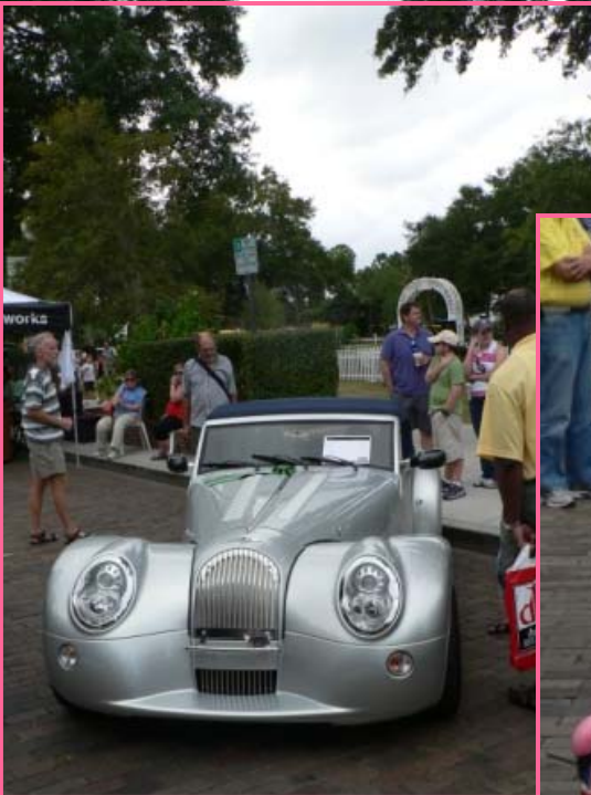
the Morgans . . .