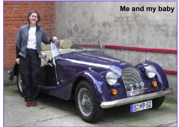
Me and my baby