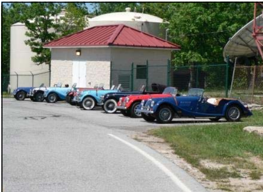
The other half the of the cars at the lookout on Cheaha Mountain