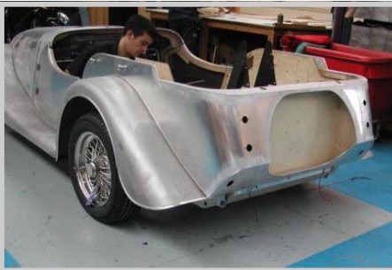
Four Seater Rear Body Contours and Rear Seat Folding Mechanism at Morgan Factory.

The photos (left) were taken of the new four seater under development. The rear body fabrication is quite unique, as is the mechanism used to allow each of the rear seats to be folded individually.