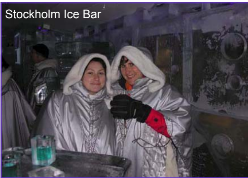
Stockholm Ice Bar

Generally the weather in Stockholm was cold, but I had been prepared by Warsaw so I had brought lots of warm clothes with me. I spent the next 4 days basically walking about and exploring the city. The guidebook that I had, had several interesting walks, each seemed to have a "theme" like the Medieval City, or the 19 th Century Working Man, etc., and were extremely interesting. Stockholm is a strange mixture, our island was the one with the museums on it, an architecture museum and the modern art museum. The modern art museum had the usual strange stuff going on in it, my favourite was definitely the 40' flesh-coloured curtain entitled "curtain colour chosen because it reminds me of the colour of my mother's knickers". ODD. The Medieval City is an interesting mish-mash of architecture and small alleys which you could easily get lost in. I basically explored the entire city by foot through weather ranging from so bitterly cold, even a coat and feather bodywarmer over my fleece were insufficient to keep me warm, to tee-shirt weather. So much to see and describe . . .