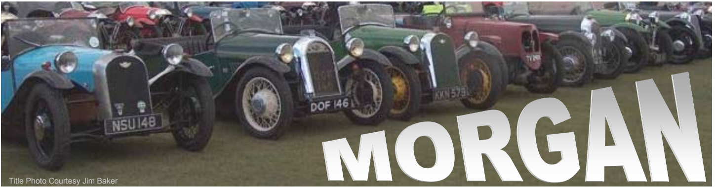
Title Photo Courtesy Jim Baker