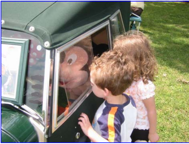
There's Morgan Magic at Any Age . . .