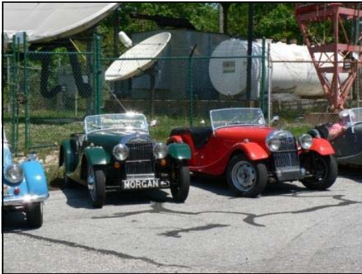
The Addie Series 1s in front of Satellite Antennas. A time warp??