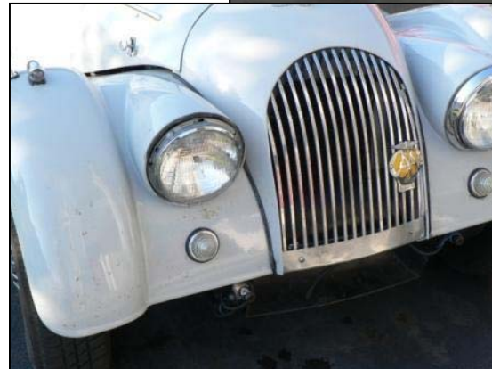
"The Bus / DHC Incident."