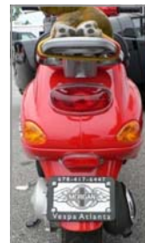
2 Wheeled MOG?