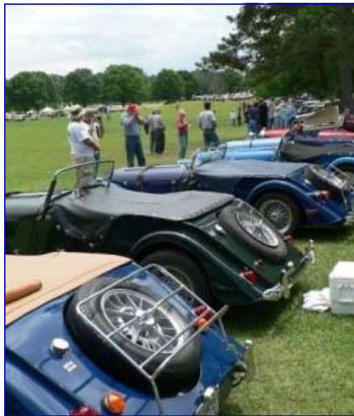
Blue Seems to be Today's 'In' Morgan Color