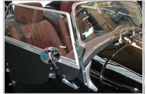
Folding Windscreen and 5 Lug Disc Wheels on Commemorative 4/4s.

There has been a lot of chatter about Factory activities of late. It has been confirmed that Morgan's Malvern Factory property was sold but was immediately leased back by the firm. This is believed to be a financial move, capitalizing on the high property values of the land, not an indication of a near term factory relocation. The factory appears busy, so all recent visitors report.