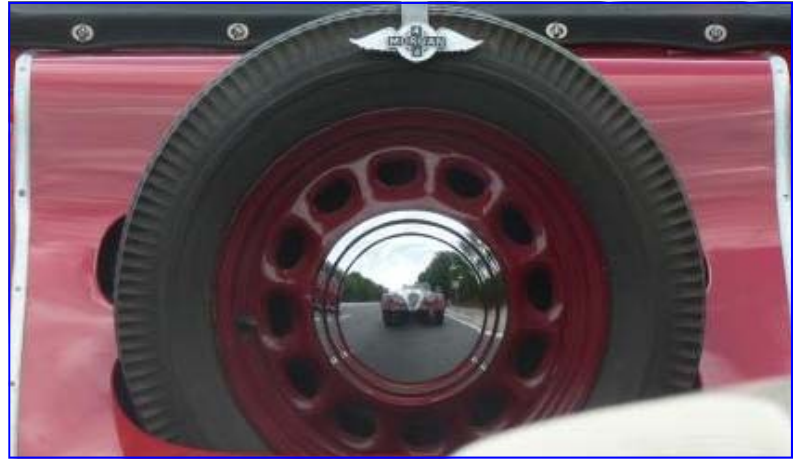
4/4 Reflected in 4-4