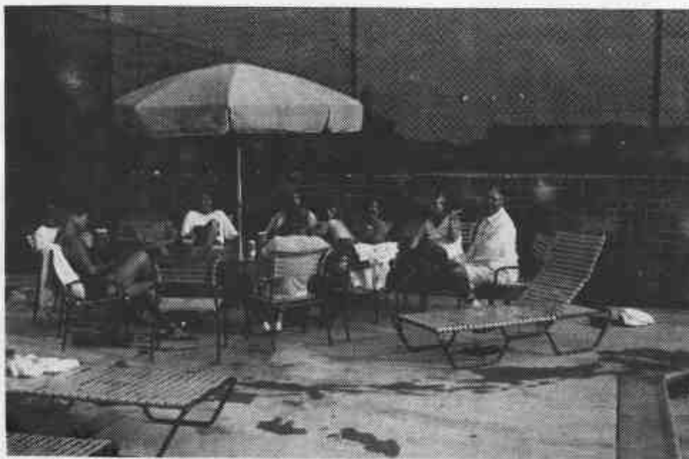
3. Finally, we finished to autocross