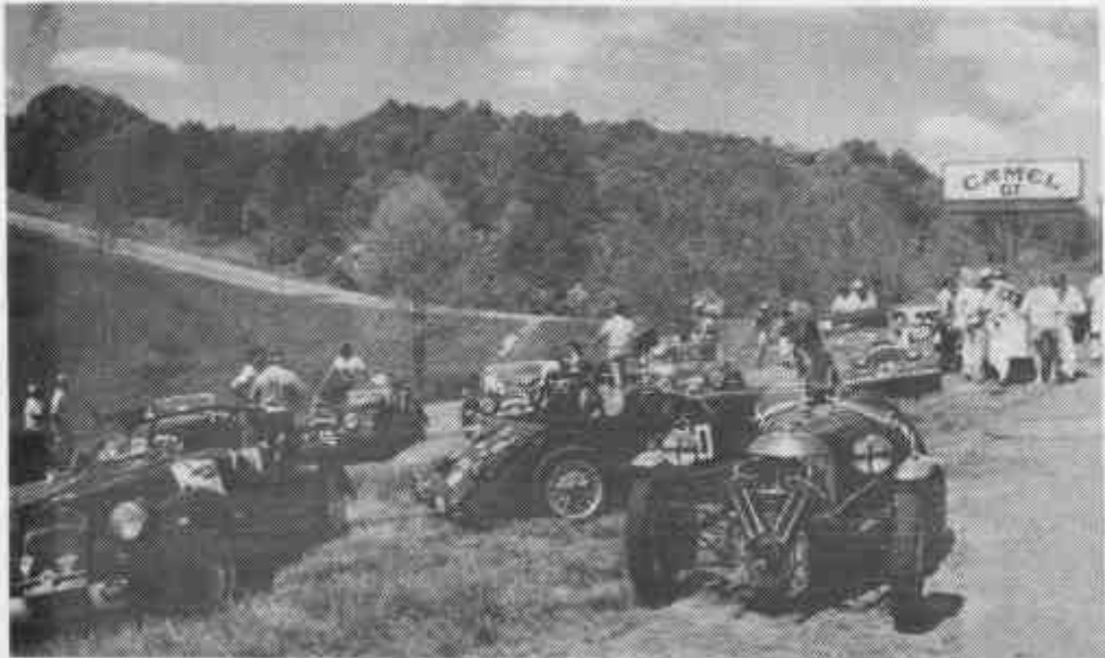
8. The beautiful, the fast, and the ugly

LADIES, there is going to be an event at MOG 20 we can take part in, and learn from. There is going to be an autocross school. Last year was the first time for this event, and not many women took part. Those who did, really enjoyed it.