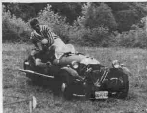
5. Come on Dad, this is serious