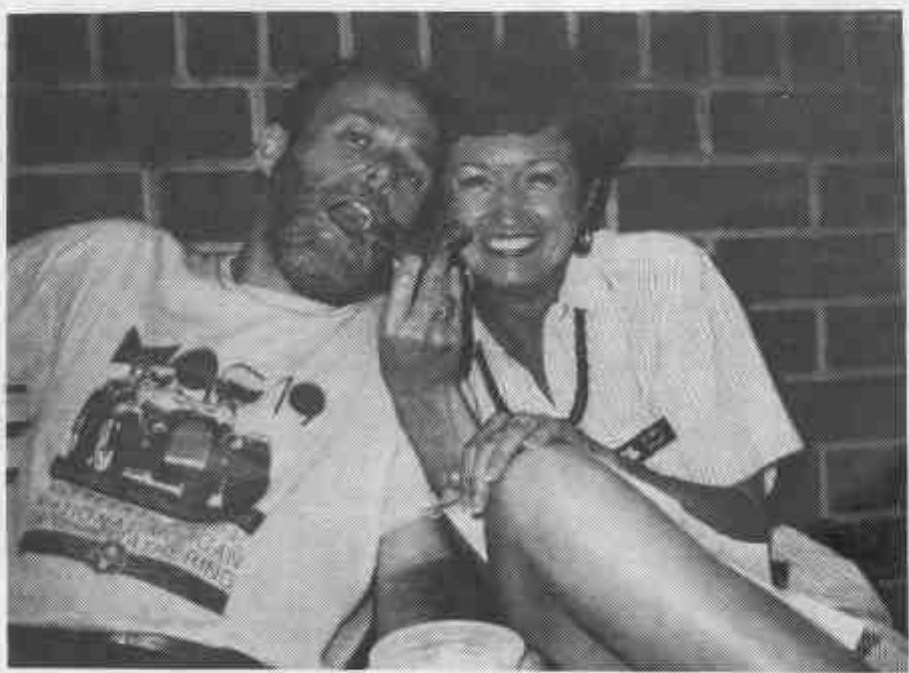
9. He thinks I am going to share