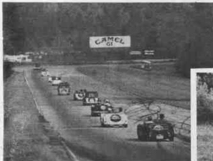
4. Odd, all headed in the same direction at the same time