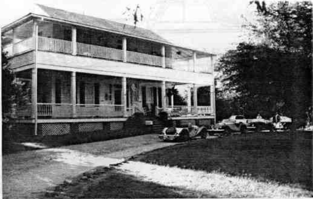
Liberty Hall Inn, Site of the 1996 MOG South Fall Meet