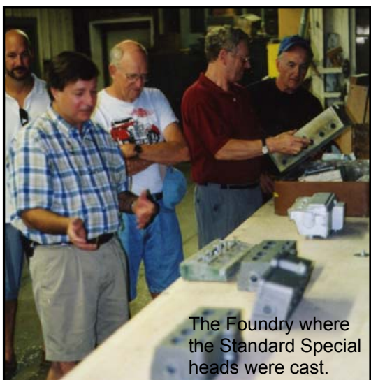
The Foundry where the Standard Special heads were cast.