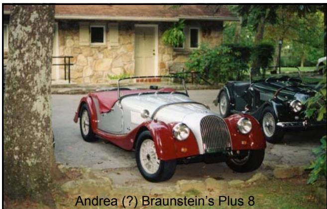
Andrea (?) Braunstein's Plus 8