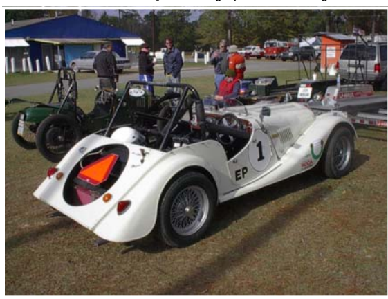
Michael's daughter's Super Sport in the paddock.