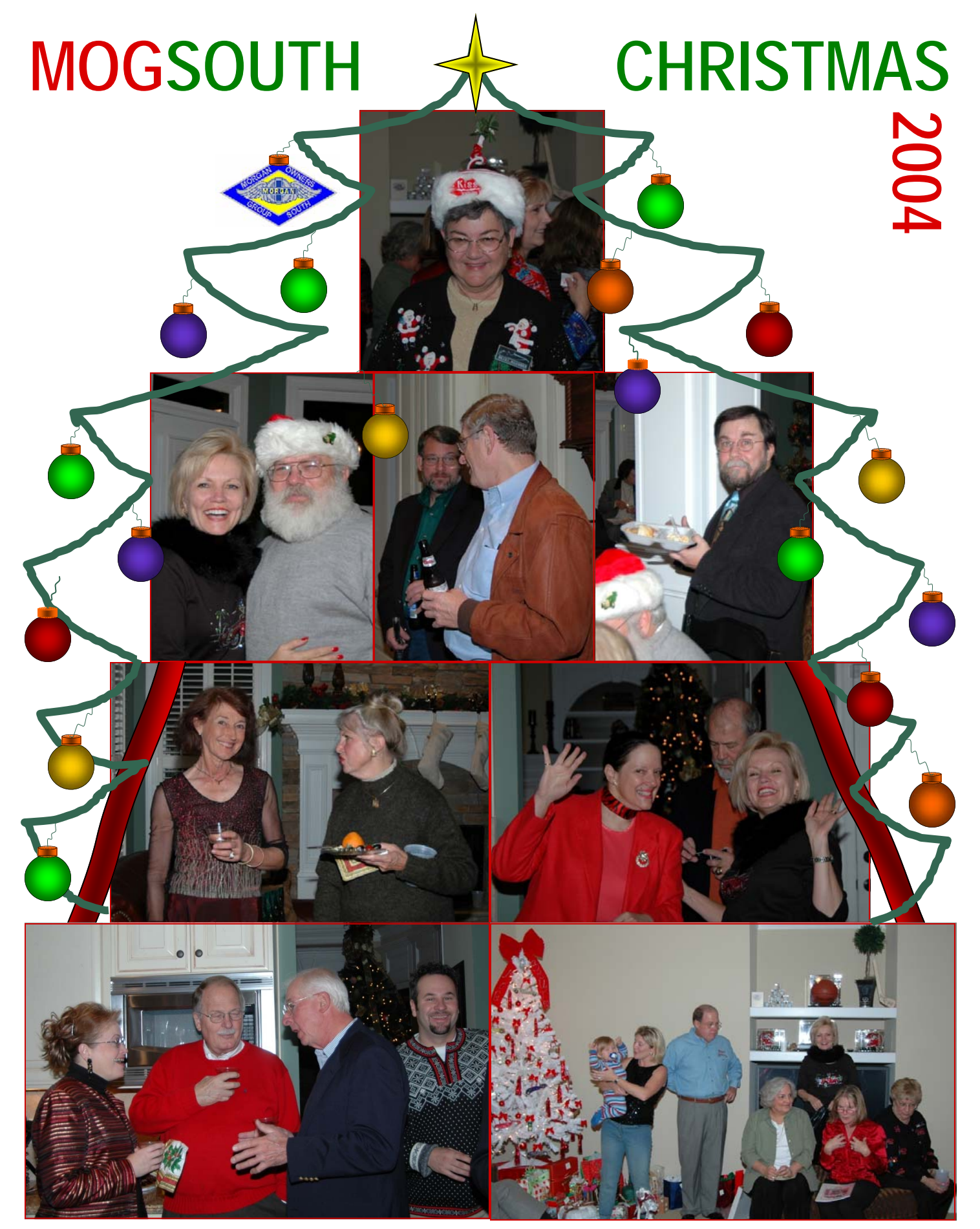
Happy Holiday Season and Best Wishes for a Happy and Prosperous New Year!! ^3