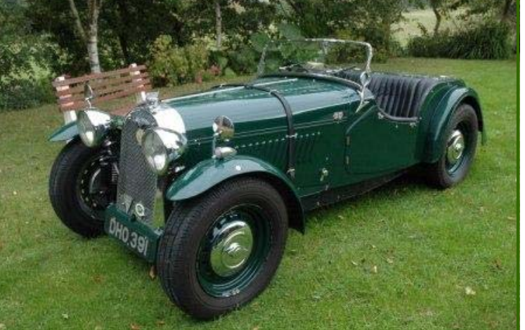
George's 1939 Series 1