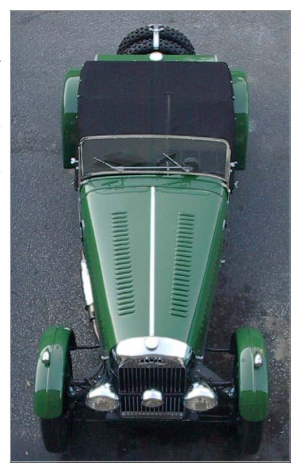
John Bigler's 1948 Series 1 in Aiken, SC

The plan was to have us split up for the Friday evening meal and go our own ways to sample one of the many fine restaurants in Aiken; yet we somehow all turned up at 'Olive Oils' Italian Bistro. They definitely weren't ready to handle the rowdy MOGSouth crowd. As Aiken is a horse town and the fall Steeple Chase was ongoing, many of the hotels and restaurants were already booked. But needless to say, they were gracious and did their best to accommodate us all, but most of us overflowed onto the front porch where it was a bit cool. But, as always, beer and wine helped greatly. A good dinner, with good friends, and then a brisk walk back to hotel and off to bed.