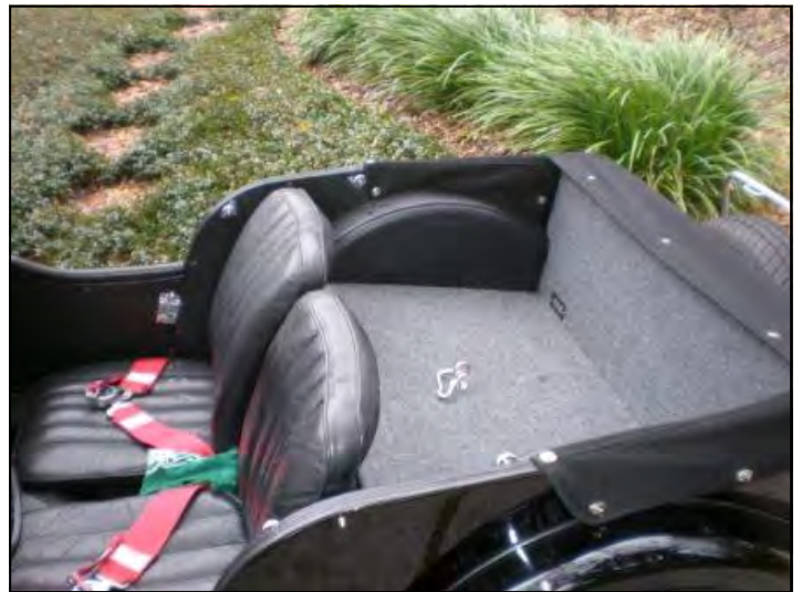
Rear Seat Platform - Ready for Dogs