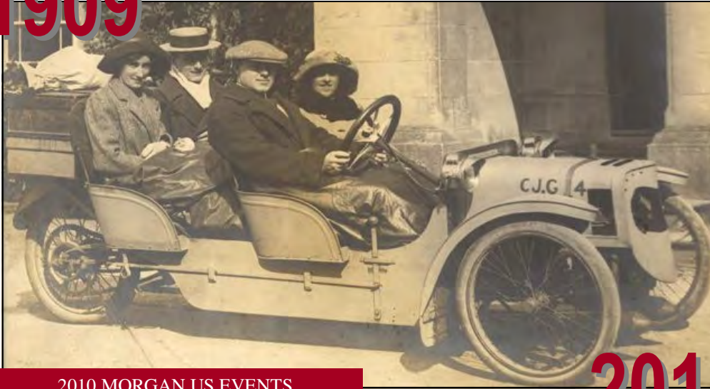
2010 MORGAN US EVENTS