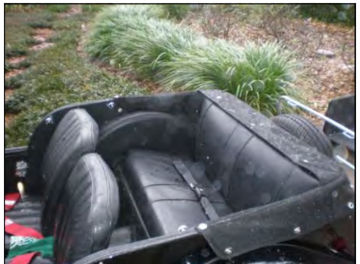
Without Dog Platform