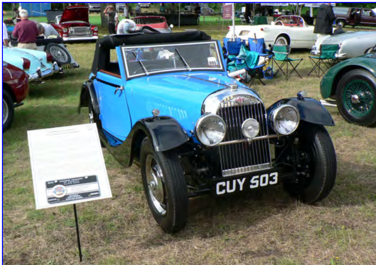
The Avon Coupe, with green Allard right and maroon Ferrari left.

Sunday was the big show and I was up early. The field opened at 0730 and I wanted to be there soon thereafter. We had positioned the car and the trailer in the designated trailer parking lot and it was about two miles from the display field. There was a bit of construction adjacent to the parking lot and I was worried a bit about picking up some mud or dirt on route so I wanted to get over to the field early so I could clean off what ever I might have accumulated, but it was raining.