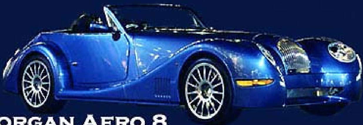
MORGAN AERO 8