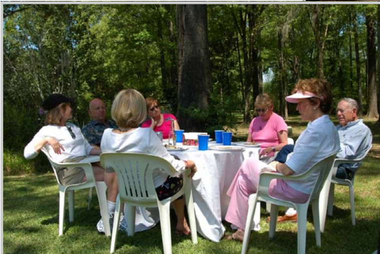
The Morgan lunch was held in warm breezes at beautiful Richland Plantation - An exquisite house and a wonderful meal.