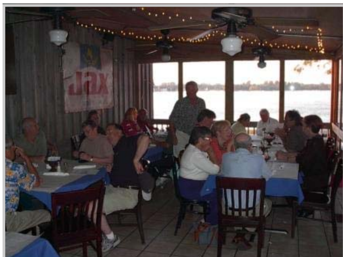
The Magnolia Grill, down along the mighty Mississippi - You can see the majestic view through the window.