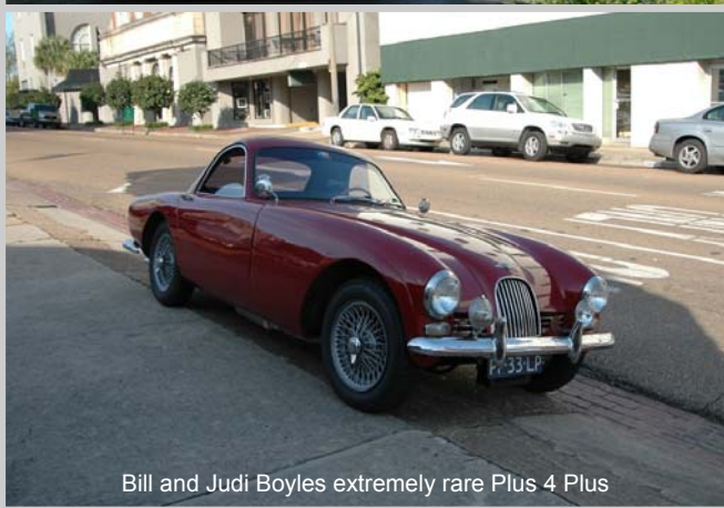
Bill and Judi Boyles extremely rare Plus 4 Plus