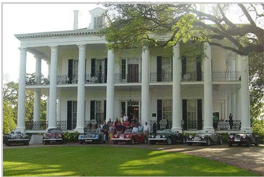
The Dunleith Mansion in Natchez