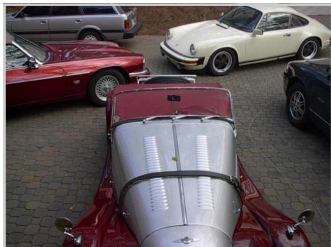
Lance's Shop with Ed Herman's DHC in Restoration and Lance's Drive - An eclectic Collection